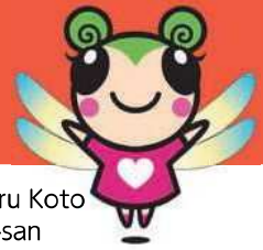
Ekkokuru Koto Sumire-san

A sudden fever! Don't they seem a little off? Could that be a cavity!?